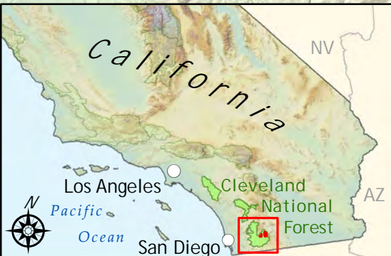
Mount Laguna and Pine Valley Community Defense & Healthy Forest Restoration Project Vicinity Map Descanso Ranger District Cleveland National Forest