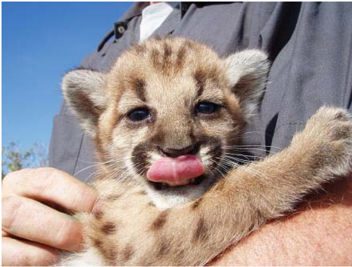
Baby cougar.