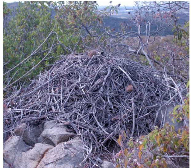
A woodrat and her nest.

Woodrats are common in the chaparral, but you will probably see their nests before you ever see them running along the stems of shrubs. Their nests are made of large piles of sticks and leaves. These nests are also home to many other animals including mice, lizards, and insects.