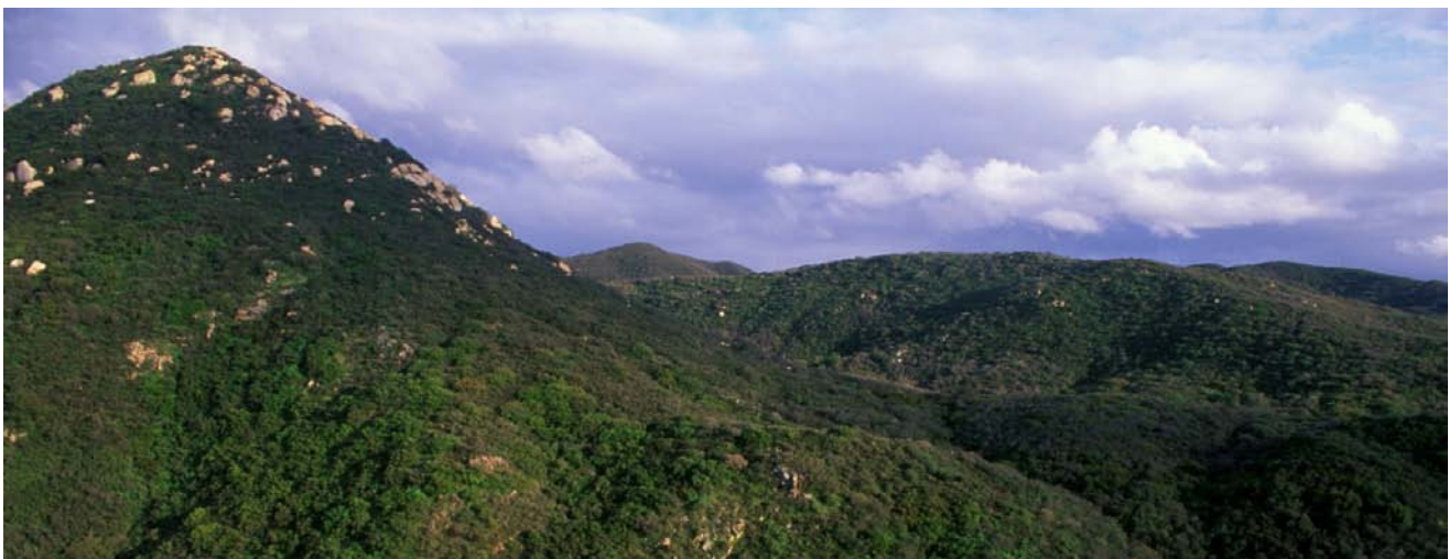
Chaparral covered mountain

Chaparral provides not only an important habitat for all the animals and plants we share the earth with, but also gives us a beautiful place to enjoy nature. Chaparral is one of California's most important natural treasures.