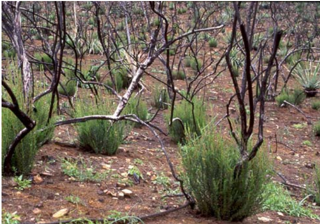
Re-sprouting chamise shrubs

If given enough time, however, chaparral plants can respond to fire in special ways. Some shrubs send up tiny green shoots from their root burls a few days after the fire is out. Within a month or two these re-sprouting shrubs decorate the burned