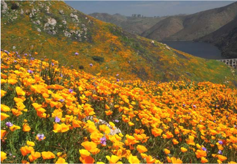
Wildflowers after a fire

Within a few years after a fire, re-sprouting plants and shrub seedlings start to take over. In 15-20 years, the chaparral is able to cloak the land with its green, soft velvet cover again.