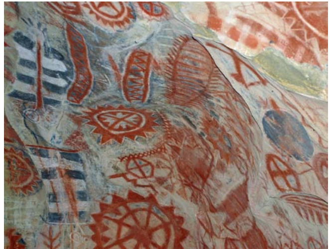
Chumash Indian cave paintings

Chaparral is often one of the easiest habitats to find near your home where you can experience an undisturbed native plant community. Although it is almost impossible to