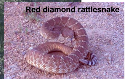
Red diamond rattlesnake