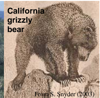
California grizzly bear