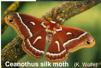
Ceanothus silk moth (K. Wolfe)